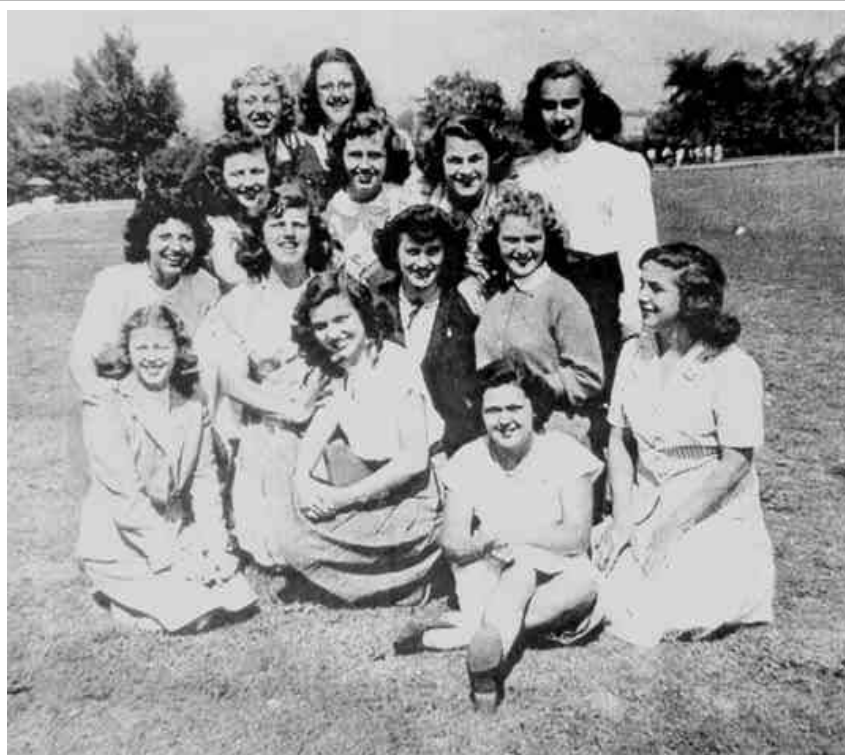
The Taft Girl's Club - formed in 1947- group still get together.