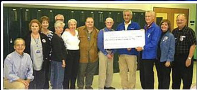
Our 50 th Anniversary Reunion Taft donation presentation September 27, 2009.

The new Taft Graphic Arts Computer Lab, which our 50 th Anniversary Reunion donation helped to fund. →